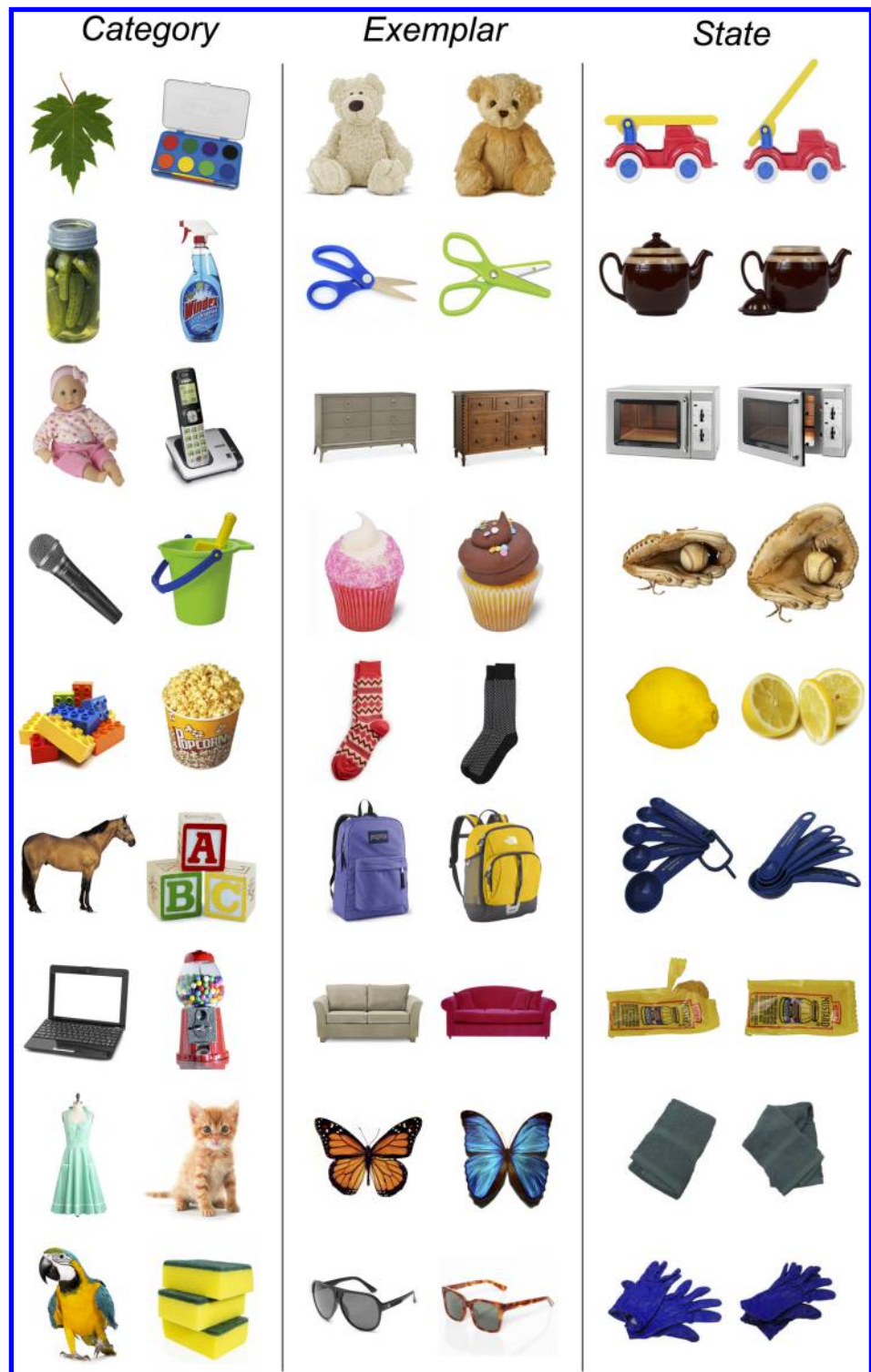
Figure 1. Nine example test pairs presented during the two-alternative forced-choice task for the three conditions (Category, Exemplar, and State). There were 50 test pairs per condition. The complete stimulus set is available at http://parklab.johnshopkins.edu/IMAGE_SETS_2.html .